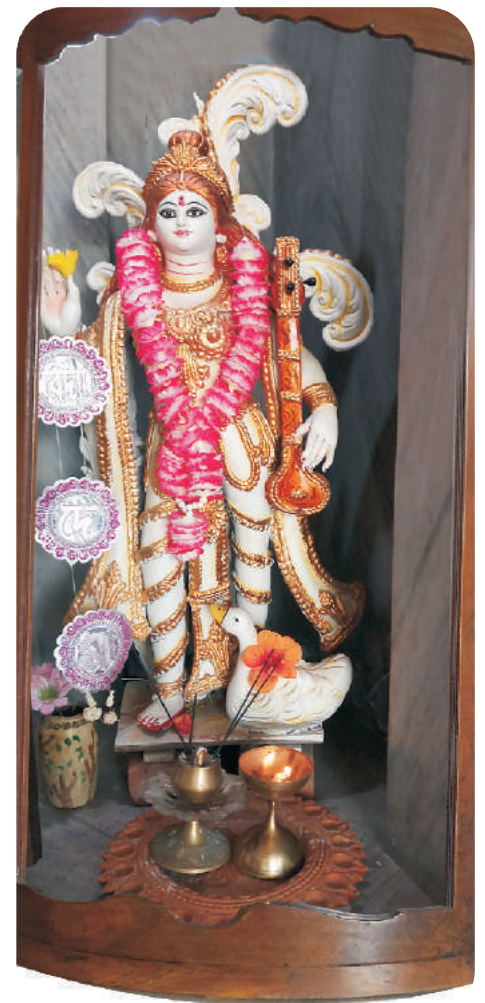
SARASWATI MANDIR IN DIST

Placement Committee consisting of Faculty Members, Senior professionals and Executives from Industry, Executives from different Private and Govt. Research Institutes and Eminent Educationists who will counsel and guide the students to place them at the Industry of their dream.